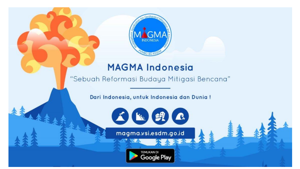
Figure 2. Magma Indonesia Application

One of the technological innovations developed in 2015 in Indonesia under the Vulcanology and Geological Disaster Mitigation Center (PVMBG) to improve disaster mitigation is the application "Magma" (Multiplatform Application for Geohazard Mitigation and Assessment) Indonesia. Magma is a multiplatform application (web and mobile) that presents integrated information and recommendations about a geological disaster (volcano, earthquake, tsunami, and ground motion). They can be accessed in quasi-real-time and interactive through the website magma.vsi.esdm.go.id.